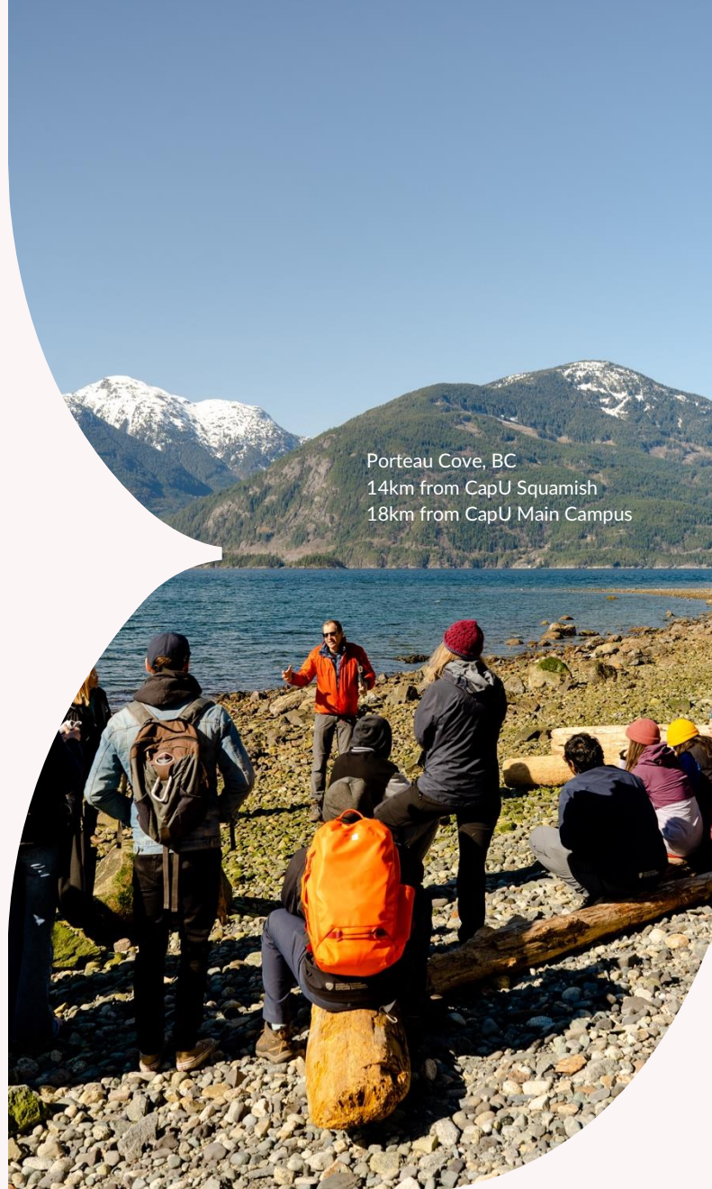
Porteau Cove, BC 14km from CapU Squamish 18km from CapU Main Campus