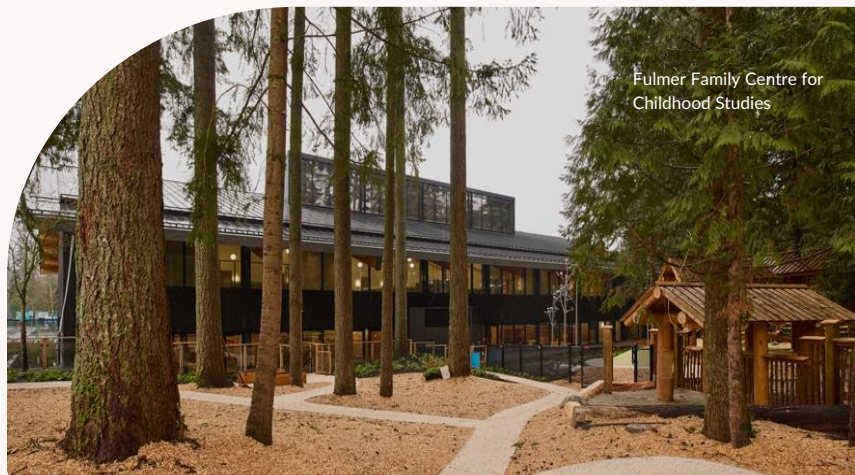
Fulmer Family Centre for Childhood Studies

▶ Pause to Explore Fulmer Family Centre for Childhood Studies