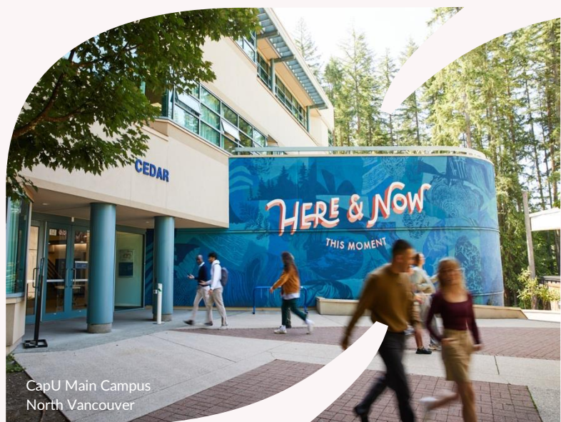
CapU Main Campus North Vancouver

“I’m endlessly glad I met the people I did. CapU is very supportive and has great professors and facilities. It’s 100% worth going if you value exploring different cultures, good food, stunning nature, and meeting people from all around the world.”