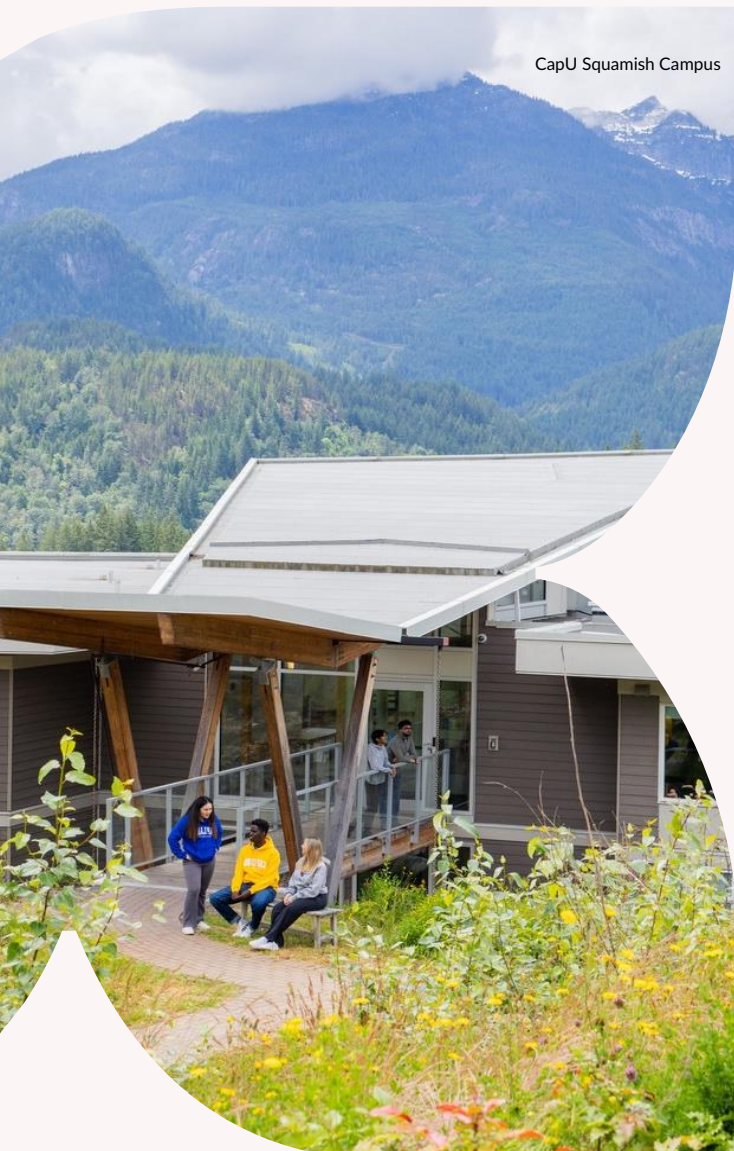
CapU Squamish Campus

▶ Pause to Explore CapU Squamish (vimeo, 0:41)