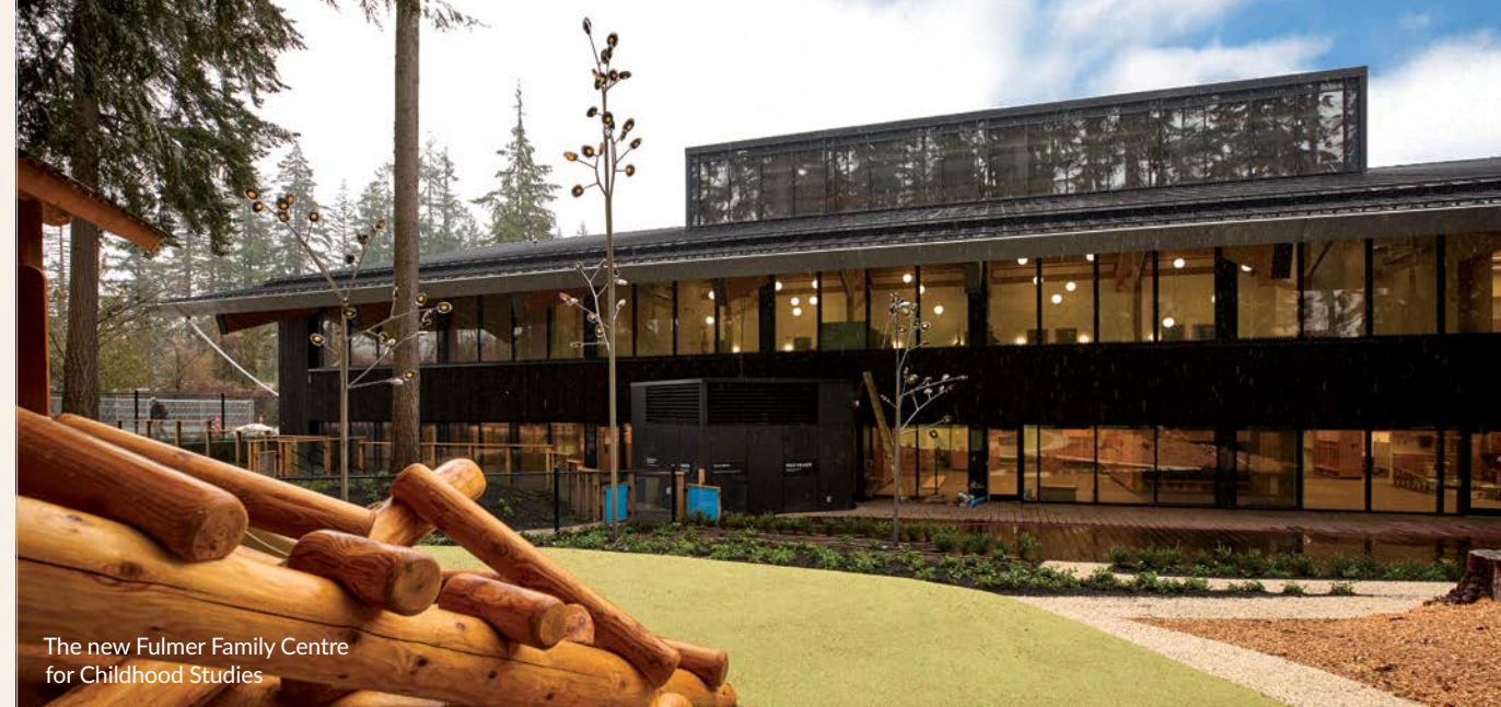
The new Fulmer Family Centre for Childhood Studies