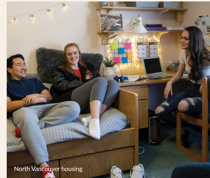
North Vancouver housing

You may also choose to live off campus in a homestay or in shared or independent rental housing. For more available accommodation options and an overview of B.C. tenancy rights, please visit capilanou.ca/intl-accommodation