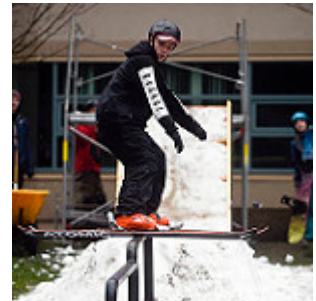
Competitors take part in the annual Rail Jam event on Feb. 1, 2018.