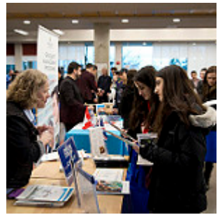
Capilano University hosted Explore CapU Info Night on March 1, 2018.