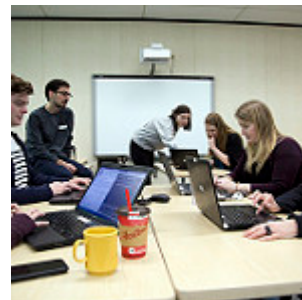
The CapU Library hosted an Art+Feminism Wikipedia Edit-a-thon, an event designed to improve content on feminism and the arts on Wikipedia, on March 6, 2018.