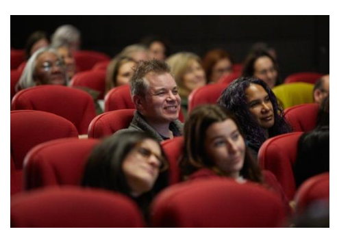
Employees attending the President's Perspective in February

On February 2, the events team, in partnership with the president's office facilitated the biannual President's Perspective in CapU's Bosa Centre for Film and Animation. The topic for this presentation was Life Enhancing Experiences for Learners and Employees at CapU. The presentation highlighted feedback from the University community and discussion around how CapU can improve the experiences of learners and employees and continue to advance Envisioning 2030 goals. The event was well attended both in person and online and invited varied discussion and constructive ideas from CapU employees across all departments.