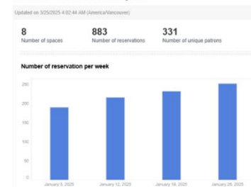
Room reservation analysis