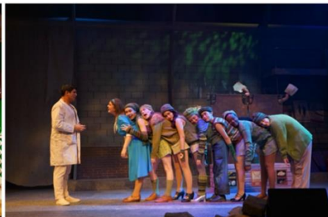
'One Man, Two Guv'nors' and 'Alice By Heart' presented at the BlueShore Centre