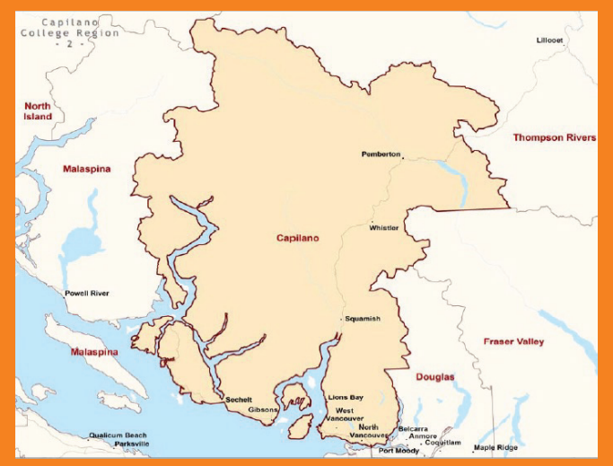
Figure 1: Capilano College Region

Table 1 gives the shortest driving distance from the city hall of each of the cities hosting the main campus of their college region university, used as a proxy for population centre. However, this proxy measure may underestimate actual distances, particularly for the Kwantlen College Region as Surrey City Hall is located in the far north of the college region. This location puts Surrey City Hall out of the population centre of the region, which includes Delta and Langley, and even likely outside of the population centre of Surrey itself. Furthermore, Table 1 focuses only on the two research schools' main campuses, although both universities have downtown satellite campuses that are closer to the North Shore.