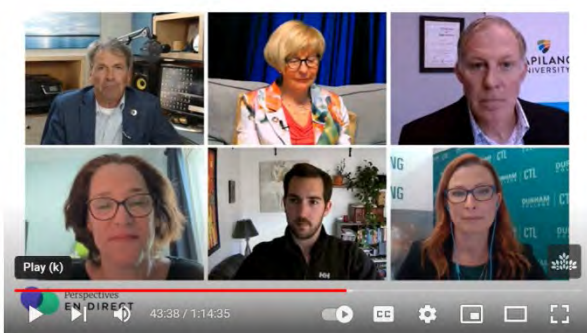
S2E5 Perspectives LIVE: Artificial Intelligence: Friend or foe?